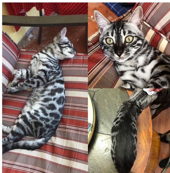
APb/APb female with mask, cape, goggles and dark expression Bred by Meghan Waals, Owned by Tricia Faul