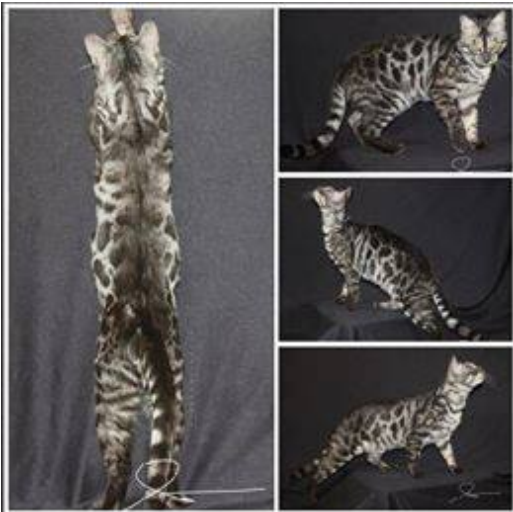
APb/a male with mask, cape, goggles and dark expression