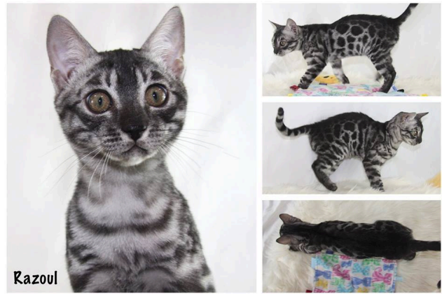
Kazoul APb/a male with mask, cape, goggles and dark expression Bred by Meghan Waals, Owned by Mimi Cat