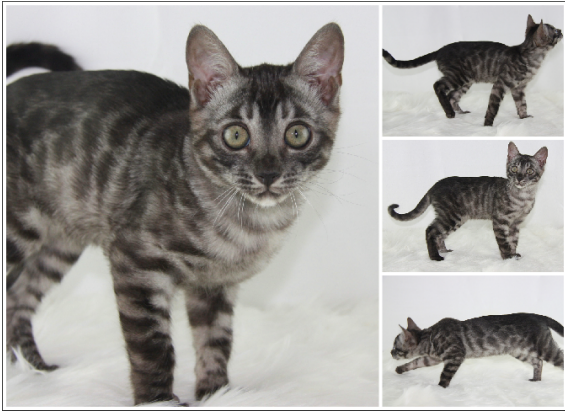
APb/a female with dark expression

Bred by Meghan Waals, Owned by Rachel Casco