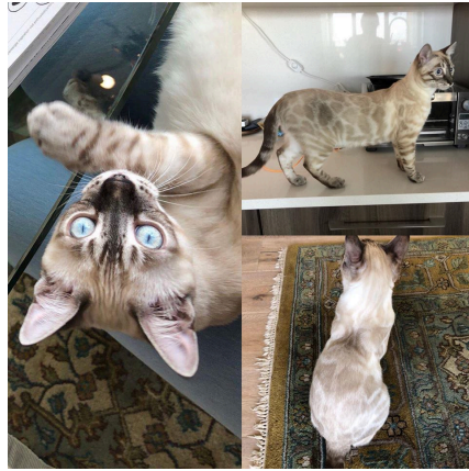
APb/APb male with mask, goggle and dark expression NO cape

Bred by Meghan Waals, Owned by Rachel Casco