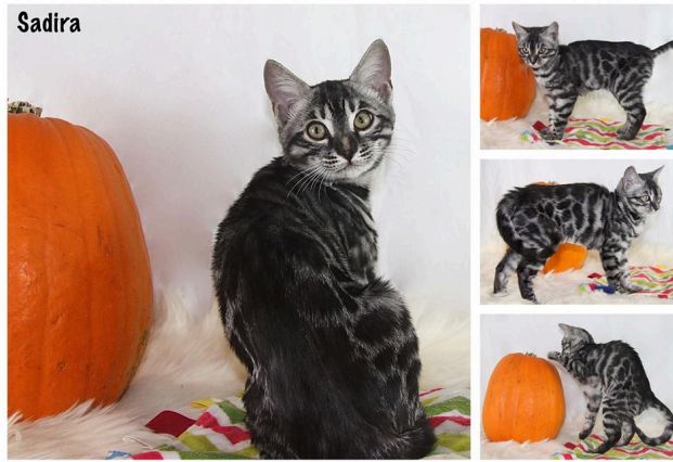
Sadira APb/APb female with mask, cape, goggles and dark expression Bred by Meghan Waals, Owned by Kat Walsh